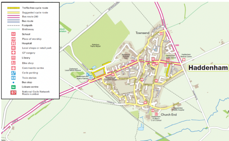
Figure 11: Cycle paths and footpaths in Haddenham

There has been much talk about Haddenham's growth and the provision of infrastructure. Or the lack of the latter. The discussion is generally about new schools, doctors' surgeries and sewage treatment plants. Transport is just as critical.