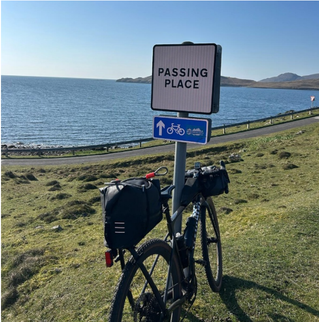
From HW's photo album, a stop on the Hebridean Way.

Bicycles have always been part of my life. But according to Cycling UK , I'm not 'the norm'. Women make half as many cycle trips as men. We're more likely to be put off by busy traffic and intimidating drivers. A study by the London Cycling Campaign showed that 9 out of 10 women cyclists experienced verbal abuse, with over 90% of those saying drivers used their vehicles to intimidate. Cycling with a group has its attraction...!