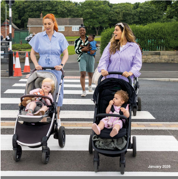
Cover of Department for Transport's Road Safety Strategy, published January 2026

We have a monster in our midst. It devours our people in numbers which should make headlines but rarely do. The Greeks (in myth) selected the victims to be fed to their monster each year. Our victims are selected by chance, but we do what we can to move the odds in our favour. With some success, it must be said.